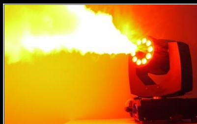
Moving Head in All Directions