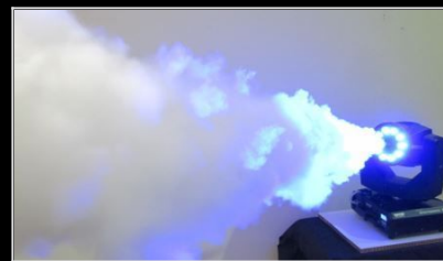
White Fog or Light Only