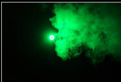
Adjustable from 10% - 100%