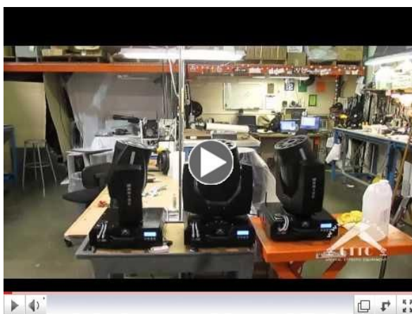
Video of Maniac Testing at CITC

CITC | (425)776-4950 info@citcfx.com | www.citcfx.com